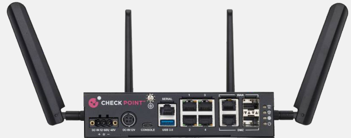
1595R 5G & 1575R (WiFi/LTE)

Check Point Quantum Rugged appliances ensure industrial sites, manufacturing floors and mobile fleets are connected and secure. The solid-state design of the Quantum Rugged security gateways operates in temperatures ranging from -40°C to 75°C, making it ideal for securing any industrial application—power and manufacturing plants, oil and gas facilities, maritime fleets, building management systems, and more. Connect your field devices to the Rugged LAN switch and your Rugged gateway to OT management networks via copper and fiber Ethernet ports as well as via integrated Wi-Fi, LTE, and 5G cellular connectivity.