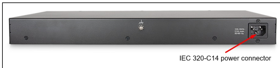
Figure 3. Rear panel of the CE0128PB switch

The following figure shows the rear (non-port-side) panel of the CE0128PB switch.