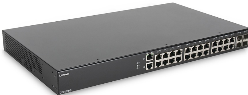
Figure 1. Lenovo CE0128PB Switch

The Lenovo CE0128PB Switch is shown in the following figure.