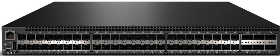
Figure 1. Lenovo RackSwitch G8272

The RackSwitch G8272 is shown in the following figure.