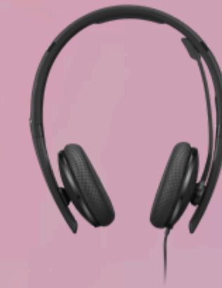
Lenovo Wired VoIP Headset (Teams) 4XD1M45626