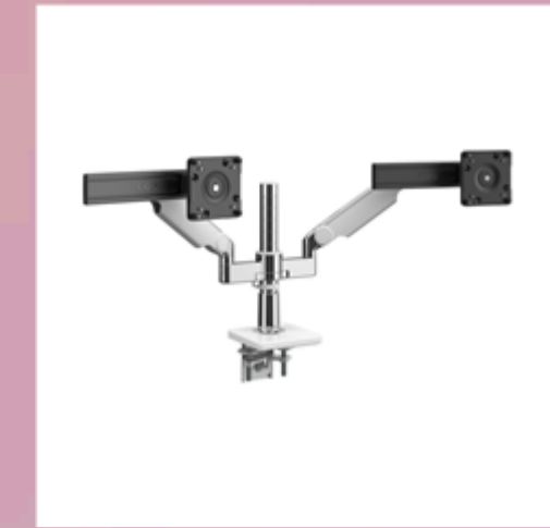
Humanscale Dual Monitor Arm White 4ZE1U10767