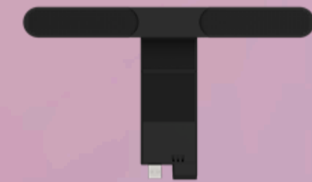
ThinkVision MS30 Monitor Soundbar 4XD1J05151

Please click here to view the full list of accessories.