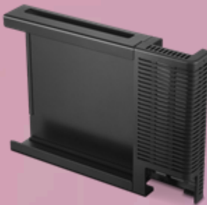
ThinkCentre Tiny Mounting Kit 4XF1R07369