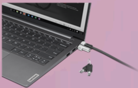
NanoSaver Cable Lock from Lenovo 4XE1L51710

Please click here to view the full list of accessories.