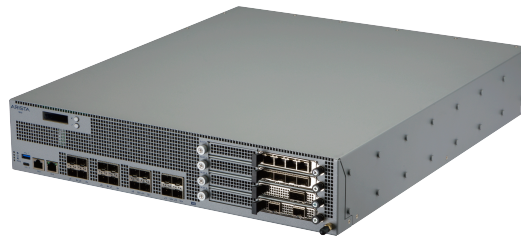
Arista ZTX-7250S MSS Traffic Mapper

To complete a zero trust policy the "last rule" drops any traffic not explicitly permitted. The ZTX then continuously monitors dropped traffic, providing insights for potential policy adjustments to explicitly allow new valid applications to connect to the network.