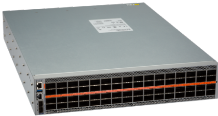
Arista 7060X6-64PE: 64 x 800G OSFP ports, 2 SFP+ ports

The 7060X6-32PE delivers 32 800G ports in a 1RU system with an overall throughput of 25.6 Tbps. The system also has 2 dedicated SFP+ data plane ports. The 7060X6-32PE offers OSFP interfaces, supporting industry standard optics and cables allowing for ease of migration to 800G. All ports allow a choice of speeds including 800 GbE, 400 GbE, 200 GbE or 100 GbE, up to 256 interfaces.