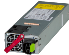
2.4kW Hot swap power supplies