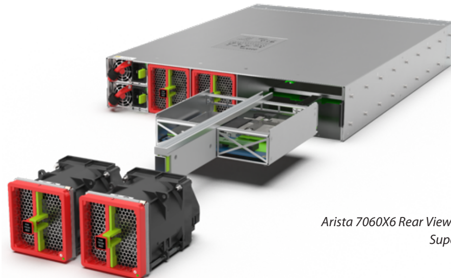
Arista 7060X6 Rear View: Accessing the field replaceable Supervisor card

The Arista 7060X6 series also uses a novel approach for the field replaceability of its components, in the 2RU variants. The Supervisor card can be field-replaced, accessing it by removing the two right-most fan units. This offers several benefits, particularly in terms of simplified maintenance, reduced downtime, increased flexibility, lower TCO, and improved reliability. This state-of-the-art design facilitates robust operational efficiency.