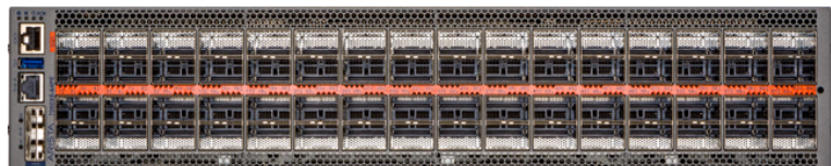
Arista 7060X6-64PE: 64 x 800 GbE OSFP ports, 2 SFP+ ports

Coupled with Arista EOS, the 7060X6 smart switch delivers advanced features for hyperscale networks, server-less compute, big data farms and AI clusters. Scalability, high bandwidth, low latency, traffic management and prioritization, network security, rich telemetry and instrumentation are the cornerstones for the next generation networks.