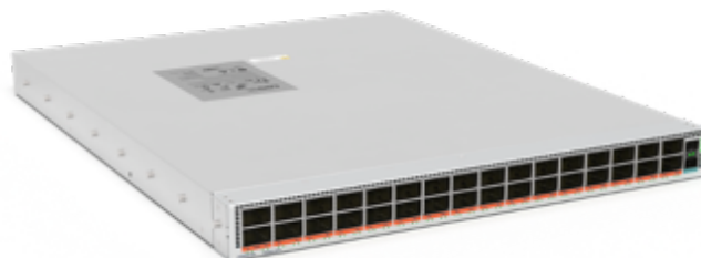
Arista 7060X6-32PE: 32 x 800 GbE OSFP ports, 2 SFP+ ports